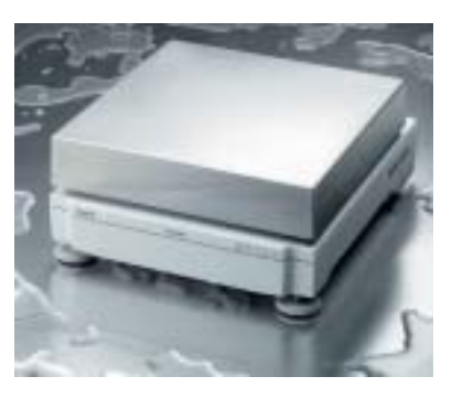
Removable terminal, large and flat surfaces: the XP is designed for fast and easy cleaning.

Thanks to its straightforward design with large, flat surfaces and removable terminal, the XP precision balance is fast and easy to clean.