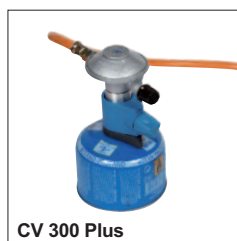
CV 300 Plus