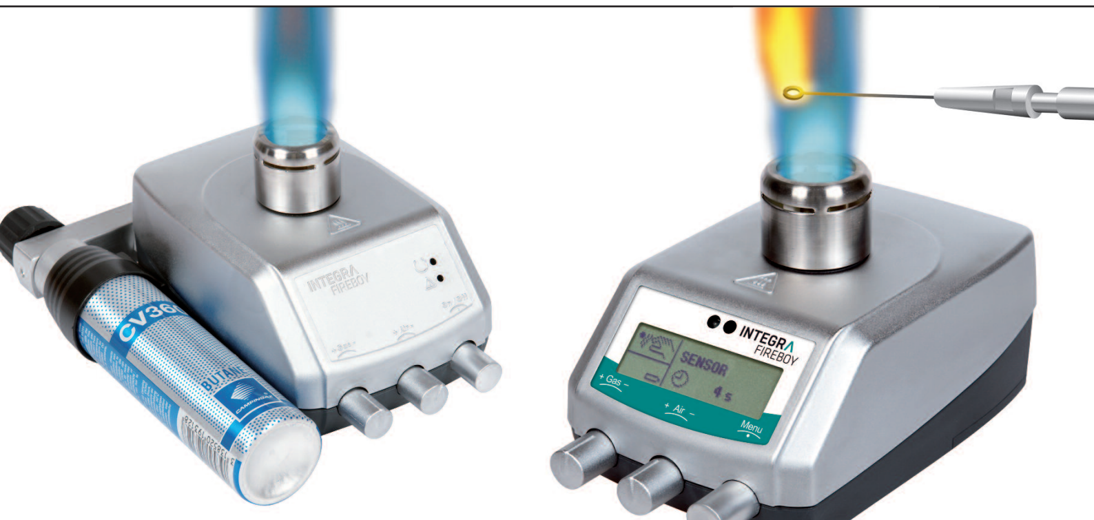
FIREBOY Safety Bunsen Burner