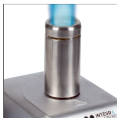
Long burner head