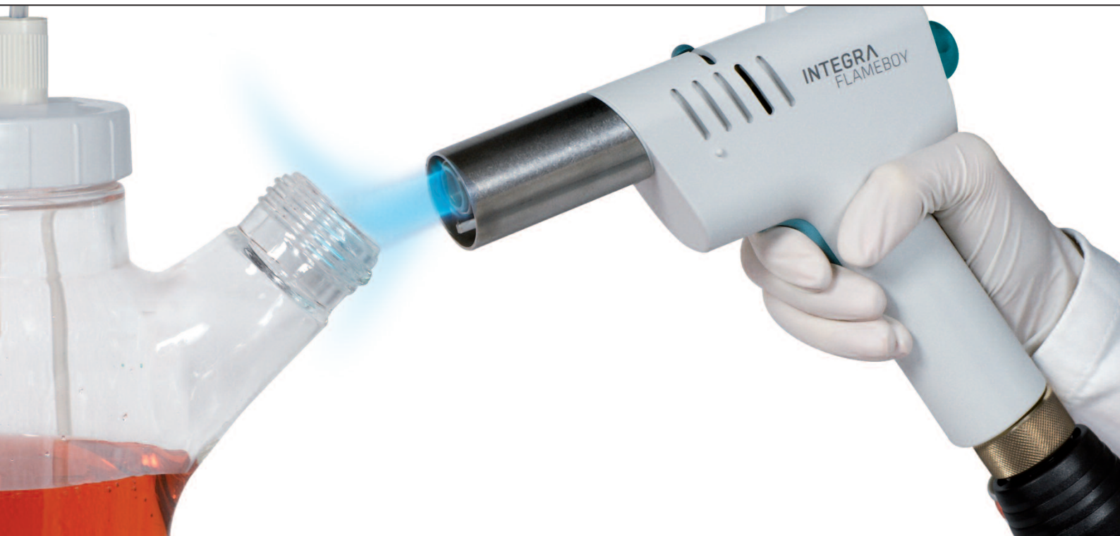
FLAMEBOY Surface sterilization at the push of a button