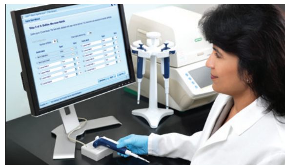
The optional RFID reader works with all Rainin RFID-enabled pipettes, and interfaces with METTLER TOLEDO's LabX™ Direct Pipette-Scan™ calibration check.