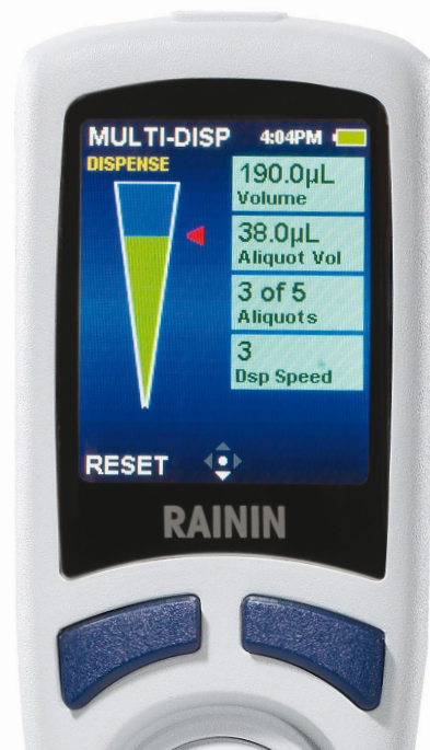
E4 in Multi-Dispense Mode