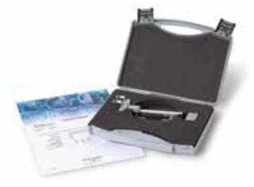
Temperature adjustment kit Periodically test and adjust the halogen heating temperature automatically with this easyto-use kit.