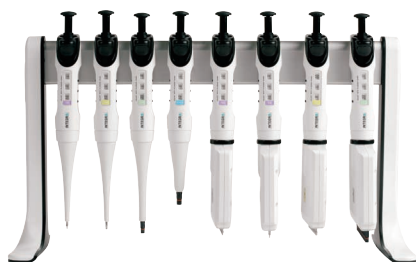
Linear stand (3215)

Storing pipettes upright is important to prevent liquid or debris from entering the tip fitting. Proper storage also extends the life of a pipette. The INTEGRA linear stand is ideal for hanging EVOLVE pipettes up off the lab bench. Up to twelve manual pipettes can be placed on a linear stand. EVOLVE shelf hooks are also available for proper storage.