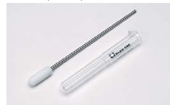
Homogeniser with overflow flare with lip and PTFE pestle, cylindrical