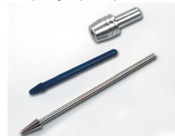
EPPI-pestle made of polypropylen and stainless steel with quick-grip clamp