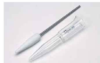
Homogeniser with overflow flare with lip and PTFE pestle, tapered

Please moisten pestle and homogenising vessel before homogenising. Carefully insert the pestle into the homogenising vessel at a low rotational speed.