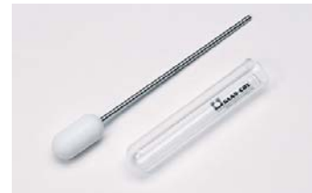
Homogeniser as centrifuge tube with PTFE pestle, cylindrical