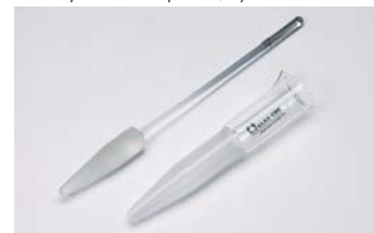
Homogeniser with overflow flare with lip and glass pestle, tapered