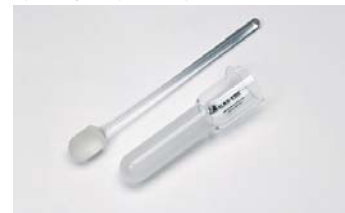
Homogeniser with overflow flare with lip and glass pestle, cylindrical