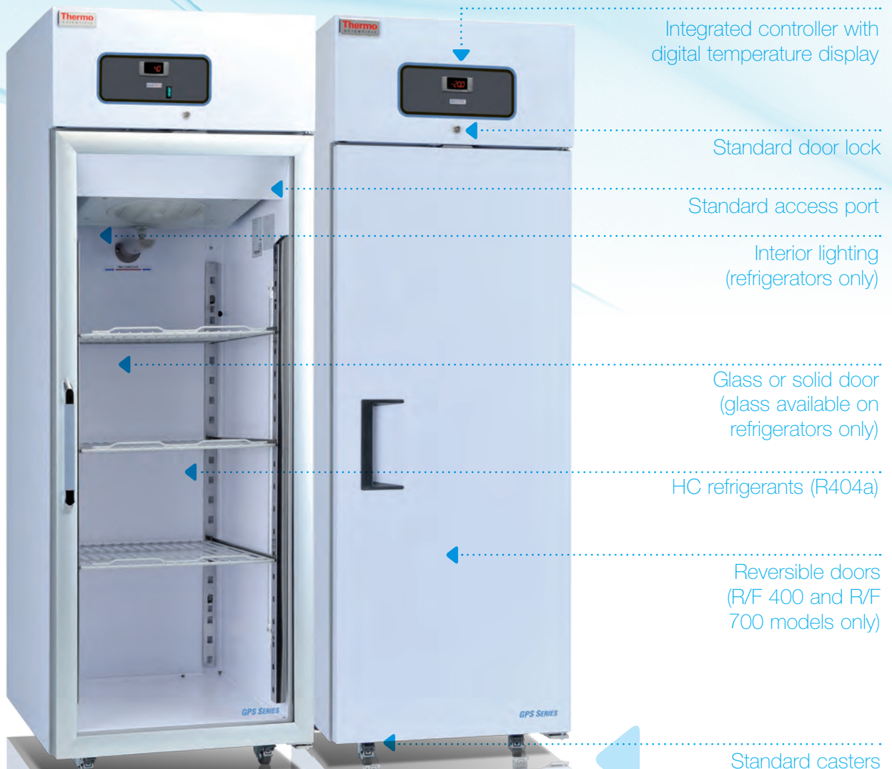
MODEL NO. R700-GAE, 700 litre glass door lab refrigerator. See pages 6-7 for ordering information.