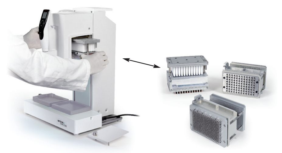
Plate holder options

Users can simply change the pipetting head of their VIAFLO 96 and VIAFLO 384 to guarantee optimal matching of the available volume range to the application performed. Changing a pipetting head of VIAFLO 96 and VIAFLO 384 is easy and takes less than one minute. Each channel of a pipetting head is independent, having its own precise piston and sealing to exclude any cross-channel influences for error-free pipetting.