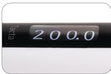
The volume is easy to read even when the pipette is angled.

The large, easy-to-read display helps you to see all four digits of the set volume from a distance without straining your eyes. The volume is easy to read even when the pipette is angled – eliminating the need to turn your head into an uncomfortable position.