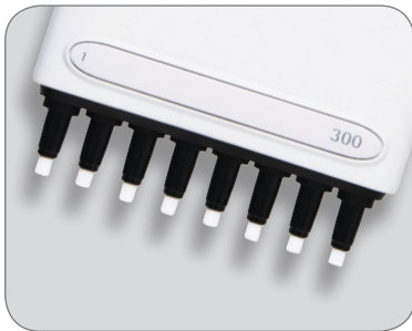
Safe-Cone Filters protect the pipette from contamination.

The exchangeable Safe-Cone Filters, used in pipette tip cones, act as barriers to prevent sample aerosols and fluids from contaminating the internal components of the pipette.