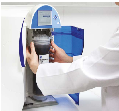
Progard® Pack replacement

Maintenance frequency is minimal, and the procedures are simplified.