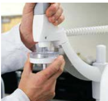
Millipak® Express 40 replacement

The service program portfolio covers all maintenance requirements such as installation, customized user training, scientific and technical support, troubleshooting, preventive maintenance visits, and all validation requirements using ad hoc calibrated equipment, procedures, workbooks and suitability tests within a GXP's environment.