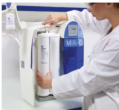
QPAK® polishing cartridge replacement